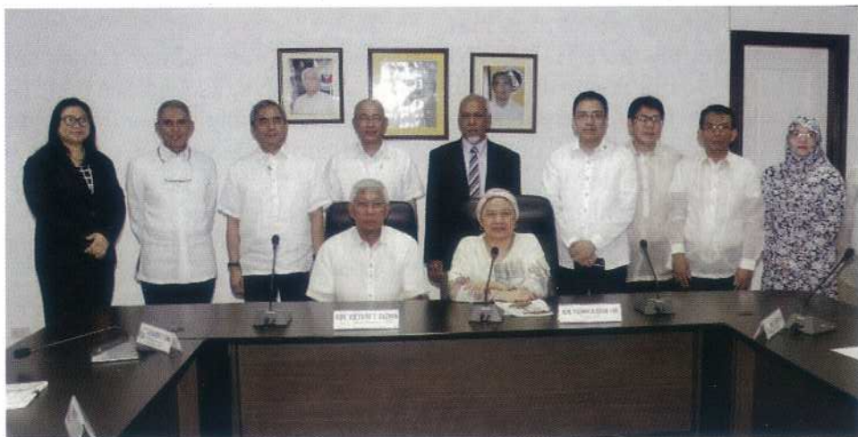
Officials of Department of National Defense, Office of Civil Defense and National Commission on Muslim Filipinos pose for a souvenir photo after signing of Memorandum of Agreement (MOA) on 10 March 2016.

The NCMF, previously named as Office on Muslim Affairs (OMA), had entered into a partnership agreement with then National Disaster Coordinating Council (NDCC) in 2009.