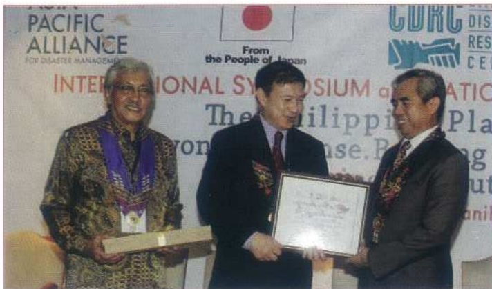
Usec Alexander P. Pama receives recognition as one of the speakers during the International Symposium and National Platform Launch on 3 March 2016.