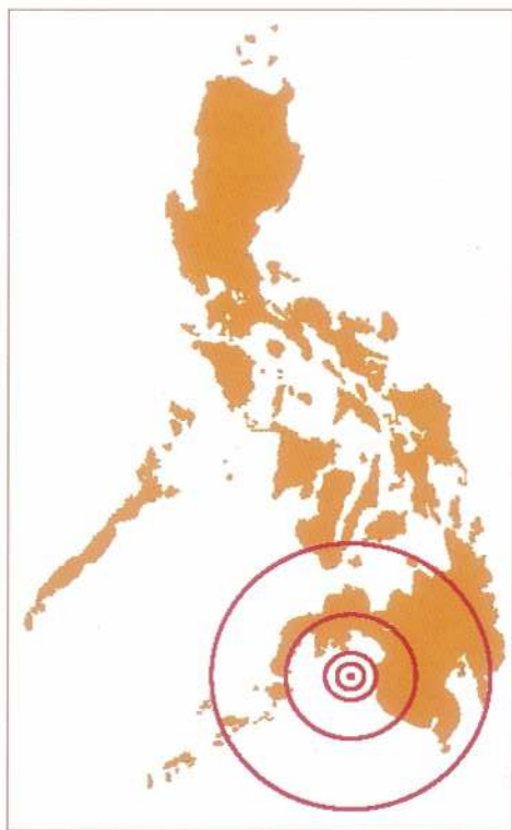
A 7.9 magnitude earthquake generated the 1976 Moro Gulf Tsunami which claimed 3,792 lives with many more declared missing.

To avoid the dangerous effects of tsunami, here are simple tips that