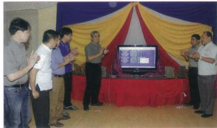
Guests applaud during the turnover of the Community-based Flood Early Warning Systems completed under GMMA Ready Project on 16 February 2016.