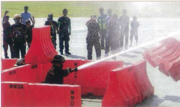
A volunteer responder demonstrates firefighting skills during the Metro Manila Emergency Volunteer Corps Recognition Day and Parade on 16 January 2016.